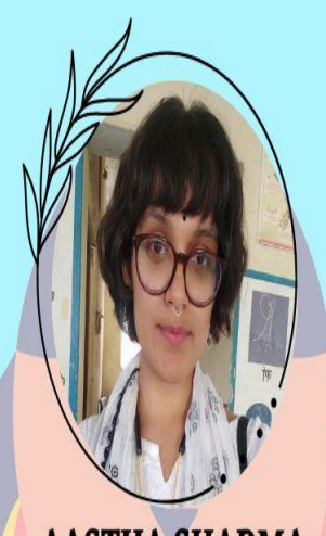
PROGRAM COORDINATOR PROJECT GARIMA