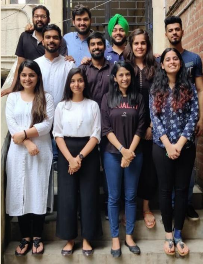
Student Members Placement Assistance Council

The Placement Assistance Council is a student run volunteer body officially designated with the responsibility of facilitating the procedure of recruitment for the final year students.